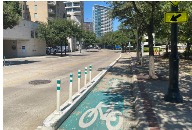
Concrete-Separated Bike Lane