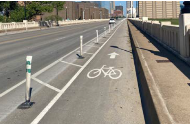
Separated Bike Lane