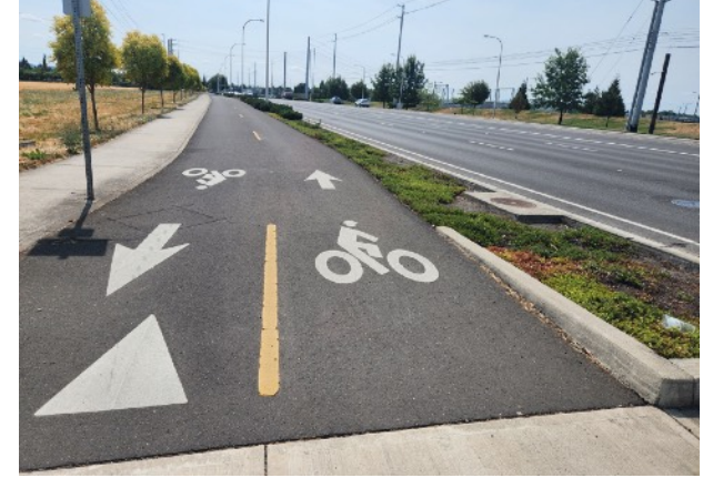
Raised Two-Way Bike Lanes